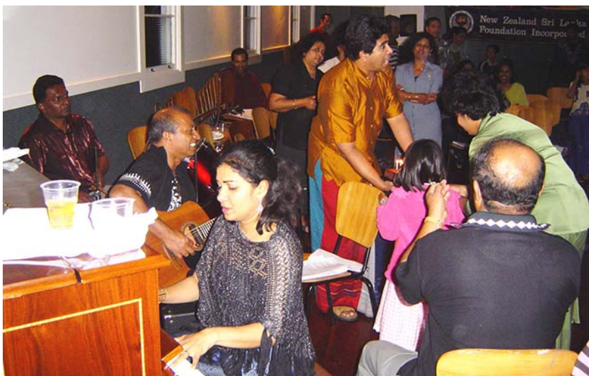
The New Zealand Sri Lanka Foundation celebrated the second member's night on the 12 th November 2005.