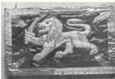
Copy of the flag of the Kandyan Kings in the 18th century, made according to the design of the original flag found in England.